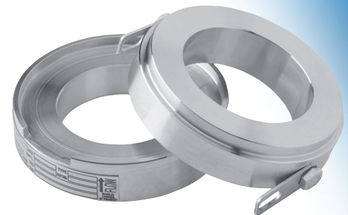
FDZ Series disk mounts into UHZ Series disk holder (refer to UHZ Series data sheet)

*Note: The maximum temperature rating of rupture disks supplied with liners and BI's is lower than the base disk material.